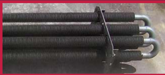
Twice the heat transfer with helically wound coils.