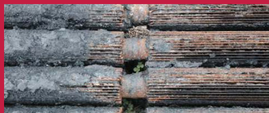
Used longitudinal coils showing significant coking.